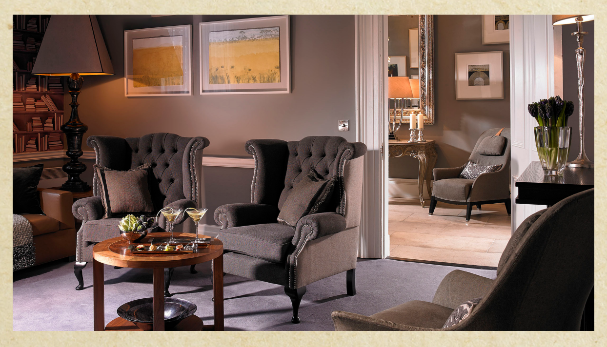
The Lovett Pearce Lounge

Each floor encapsulates the building's classic yet contemporary style wih empeccably restored Georgian features which highlight the property's original period heritage. The stone floor of the entrance foyer for instance, is charmingly worn from over 150 years of dignified footfall.